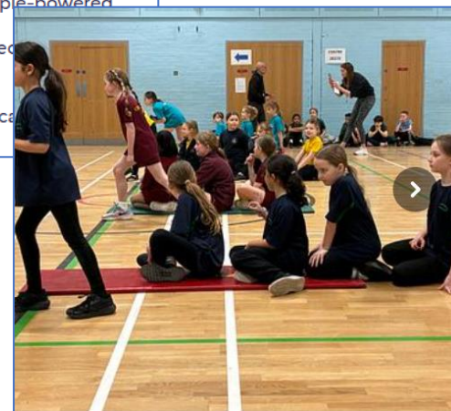
A few pics of our year 4s at the Sports Hall Athletics at SNA. A lovely event with a lovely bunch.